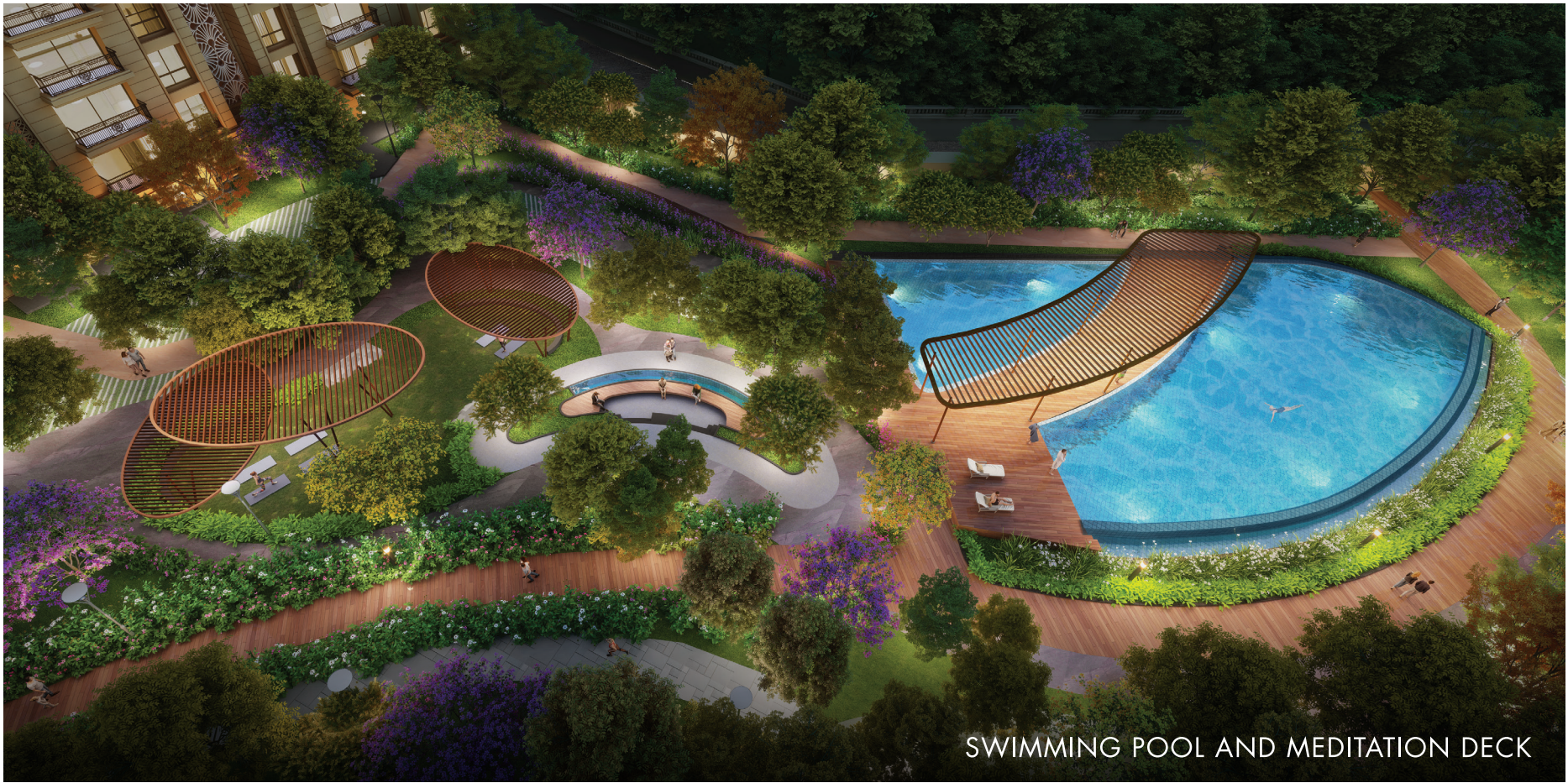
SWIMMING POOL AND MEDITATION DECK