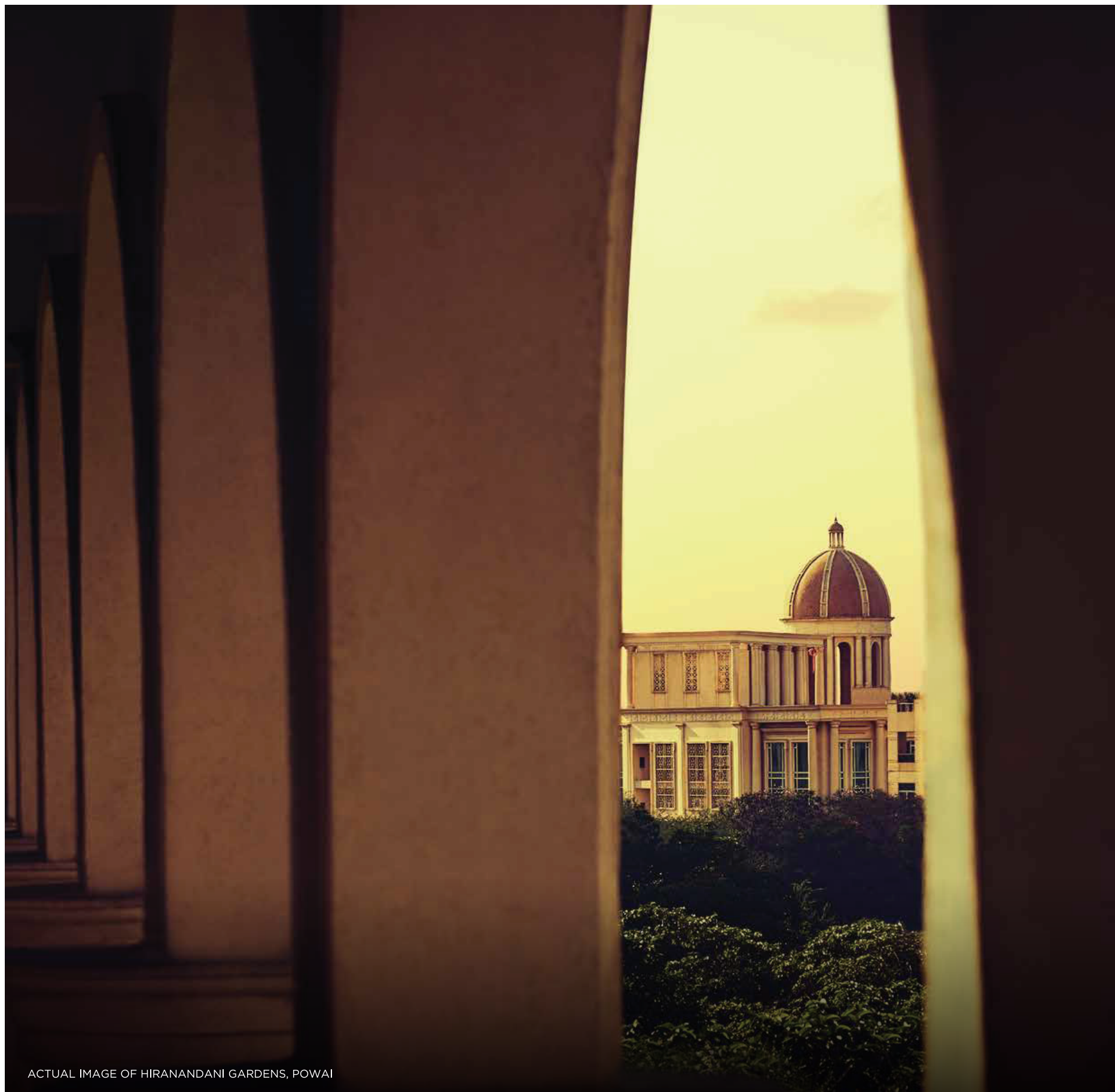
ACTUAL IMAGE OF HIRANANDANI GARDENS, POWAI