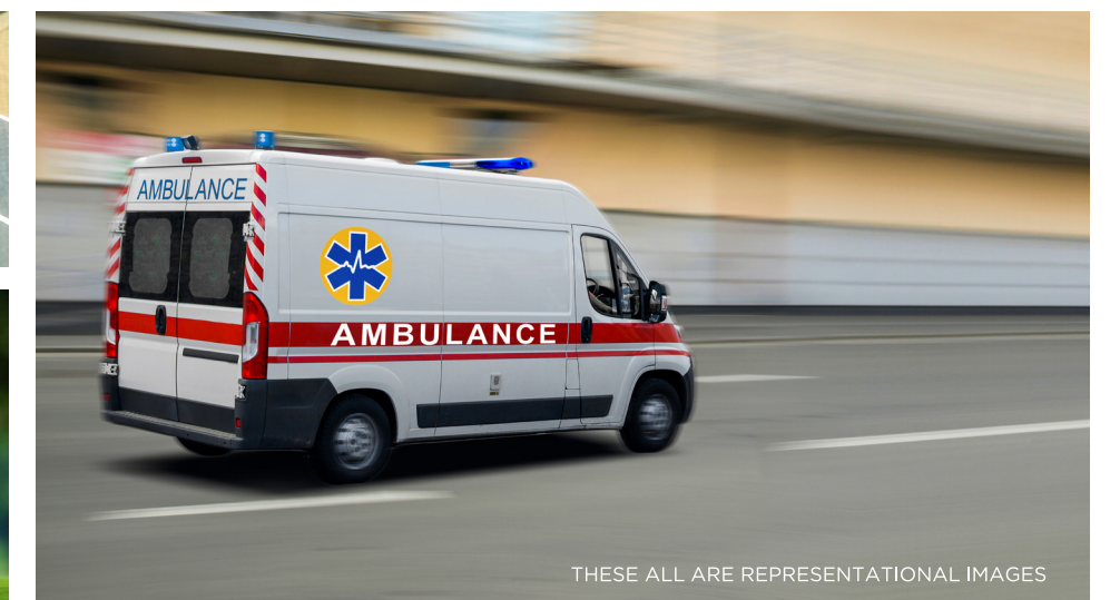
THESE ALL ARE REPRESENTATIONAL IMAGES

Crafted for champions, these world-class courts and greens let you perfect your tennis serve, volleyball spike, or golf swing with ease.