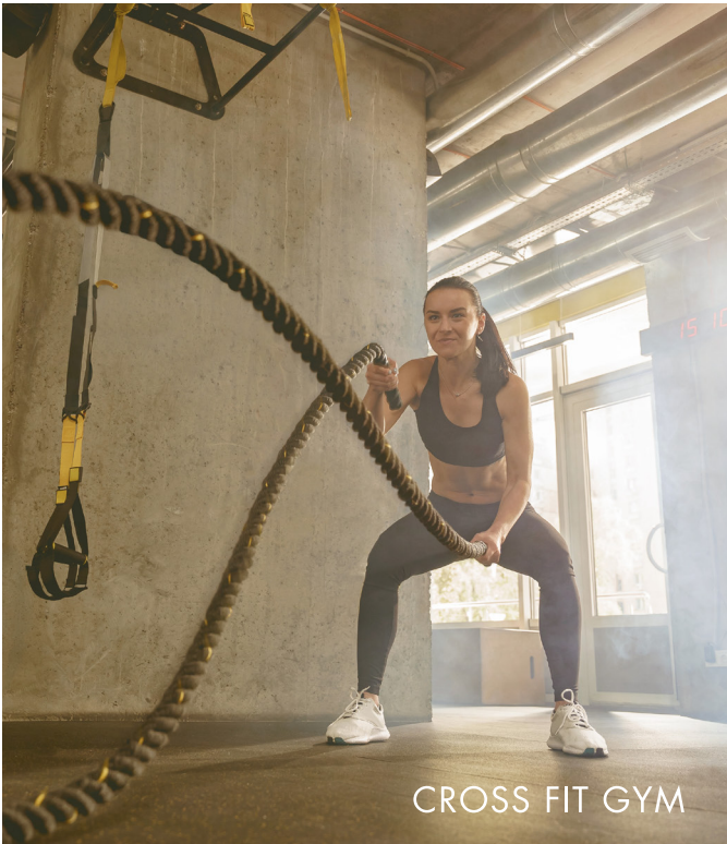
CROSS FIT GYM