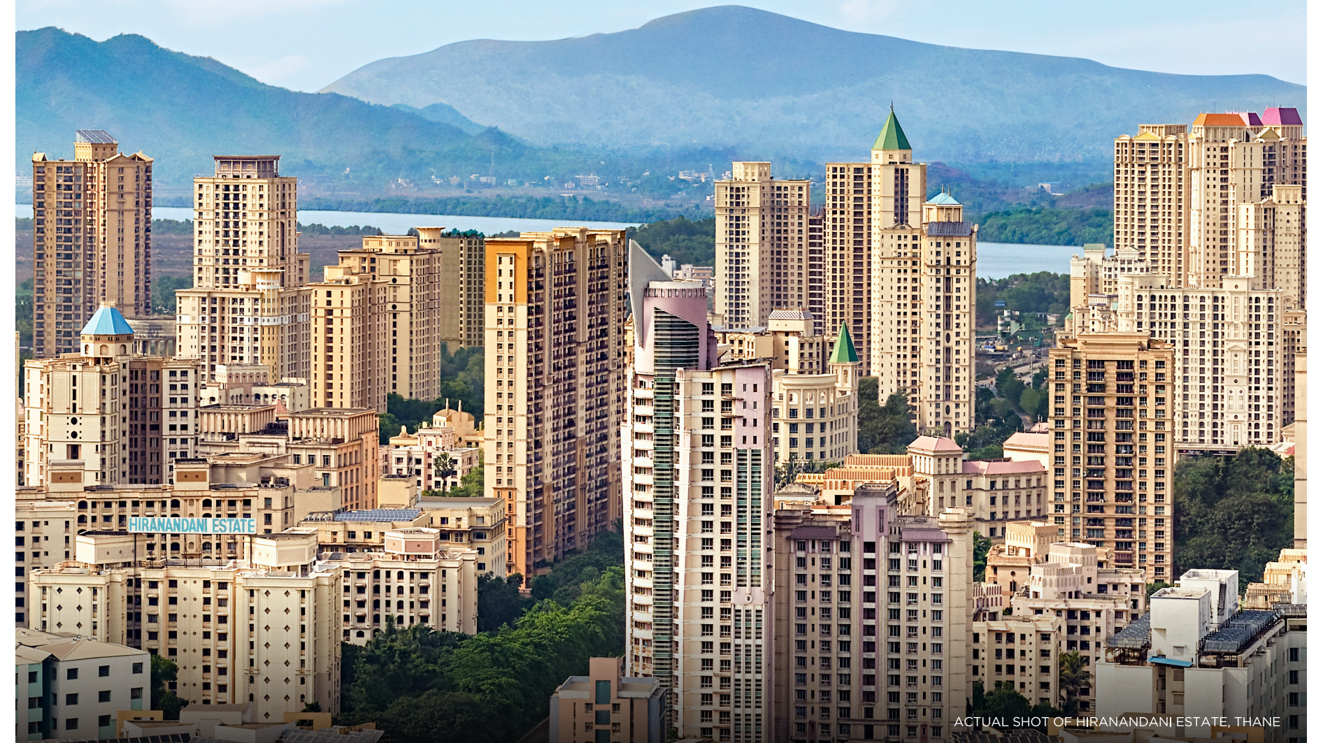
ACTUAL SHOT OF HIRANANDANI ESTATE, THANE

2 Clubhouses 1 Supermarket 1 Business Park 1 Hospital 1 High Street Retail 350+ Acres 1 School 120+ Residential Towers 24/7 Security 10,000+ Happy Residents