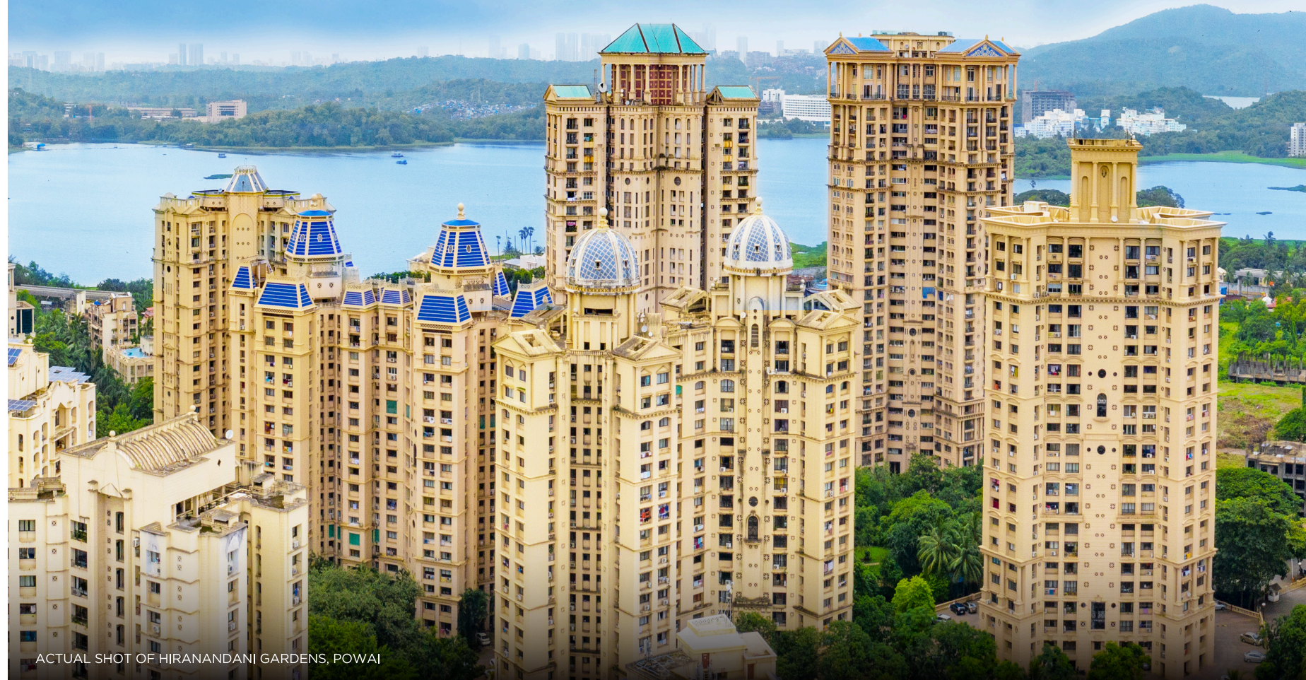
ACTUAL SHOT OF HIRANANDANI GARDENS, POWAI

3 Clubhouses 2 Ecotel Hotels 1 Business Park 1 Hospital 1 Super Market 250+ Acres 1 High Street Retail 50+ Residential Towers 2 Schools 7,000+ Happy Residents 24/7 Security