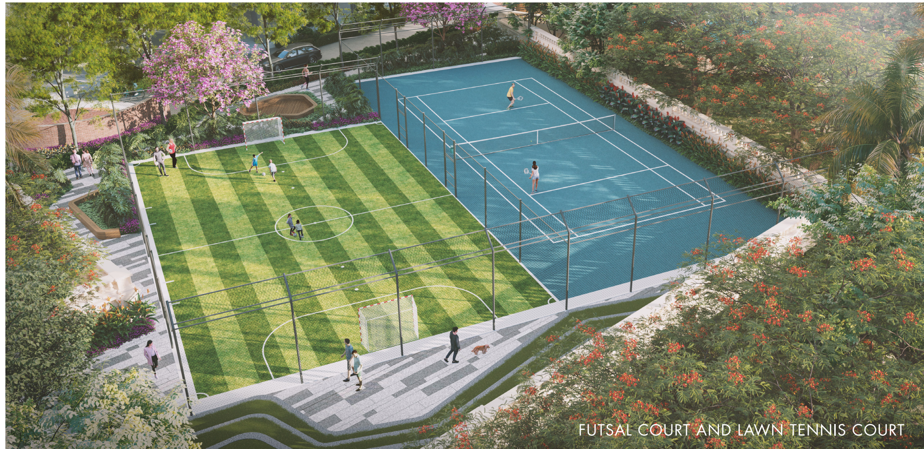
FUTSAL COURT AND LAWN TENNIS COURT